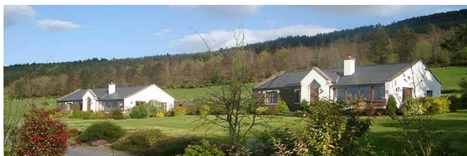
Mt. Leinster Cottages: Haus Klara 1109 sqft, 3 bedrooms; Haus Miriam 915 sqft, 2 bedrooms