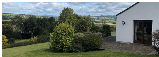
View across terrace of Haus Miriam, into the valley