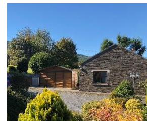
Driveway to both cottages and parking space for 5 vehicles