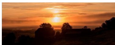
Sunrise view from bedroom of Haus Klara