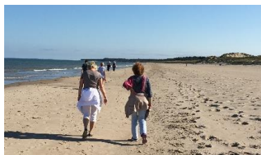
A broad, fine, sandy beach at the Irish Sea (Kilmuckridge) is only 28 miles from Kildavin