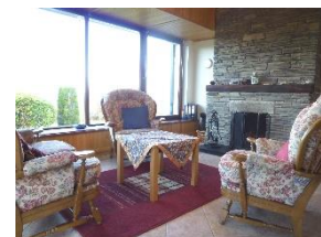
Living room with open fireplace